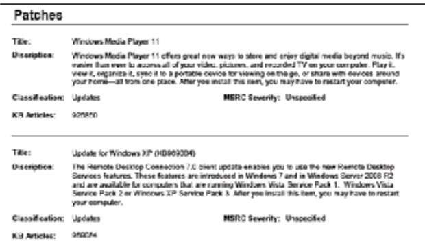
Required Patches Report Example